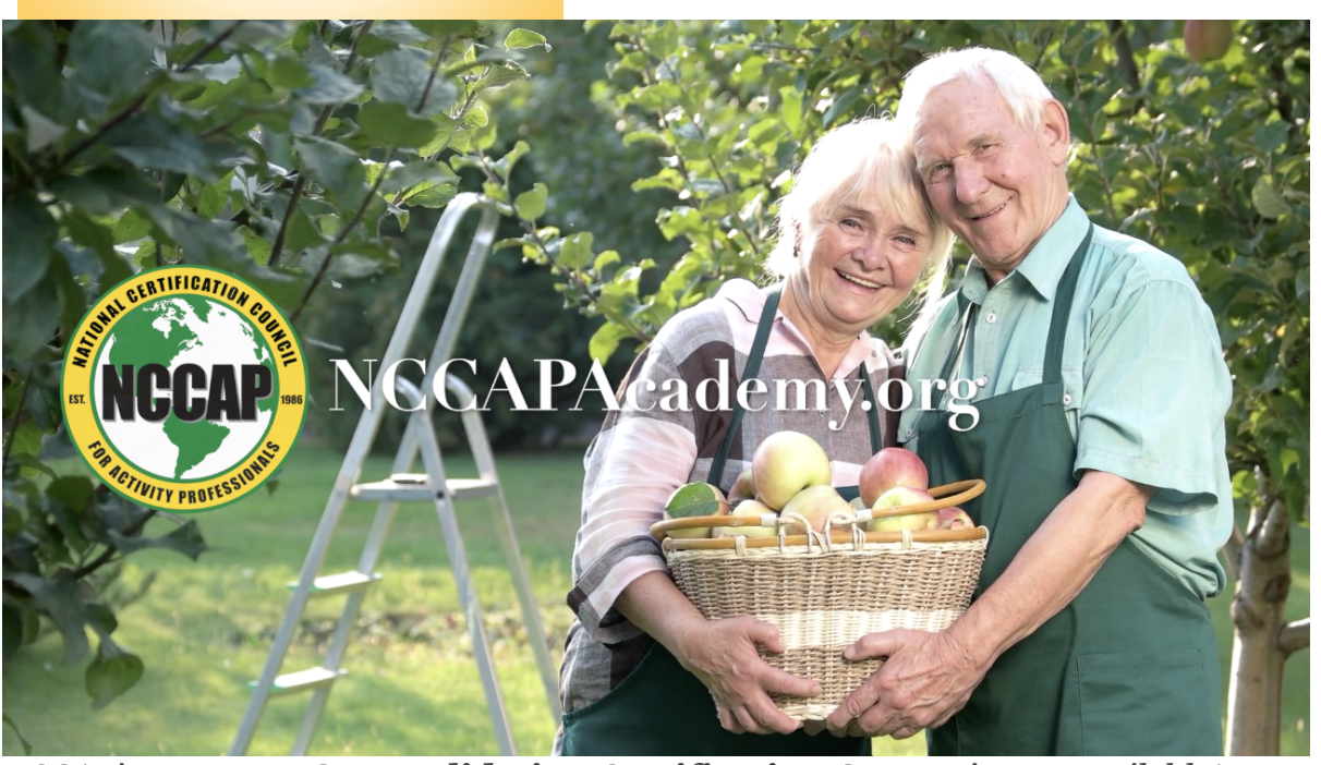
NCCAP's Memory Care Validation Certification Course is now available! Enroll now by going

to https://www.nccapacademy.org/memorycarevalidation